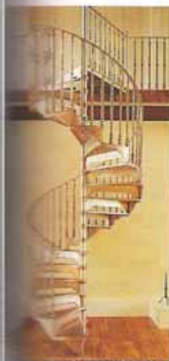
Spiral staircases are a space-saving solution. From £3,300, Cottage Craft Spirals