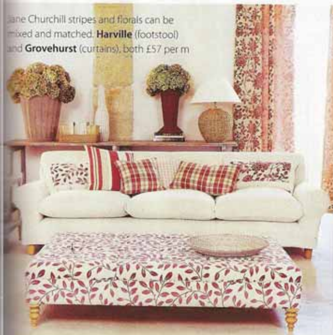
Jane Churchill stripes and florals can be mixed and matched. Harville (footstool) and Grovehurst (curtains), both £57 per m