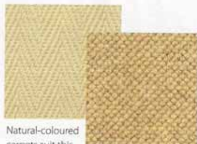
Natural-coloured carpets suit this country home. Rusticweave (top), £38 per sq m; Riverbed , £35 per sq m, Axminster Carpets