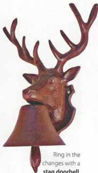
Ring in the changes with a stag doorbell , £14.95, from Diana Forrester