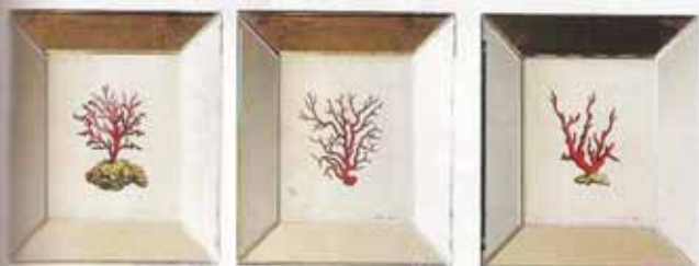
Elegant mirror-framed prints reflect light around the room. Coral prints in frames , £255 (for a set of six), Graham & Green